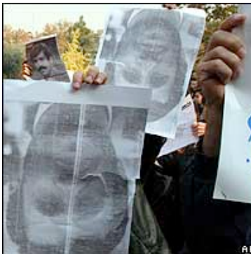
Iranian students have shown open opposition to Iran's president

Eight have been jailed from Amirkabir University where students called the president a dictator to his face when he